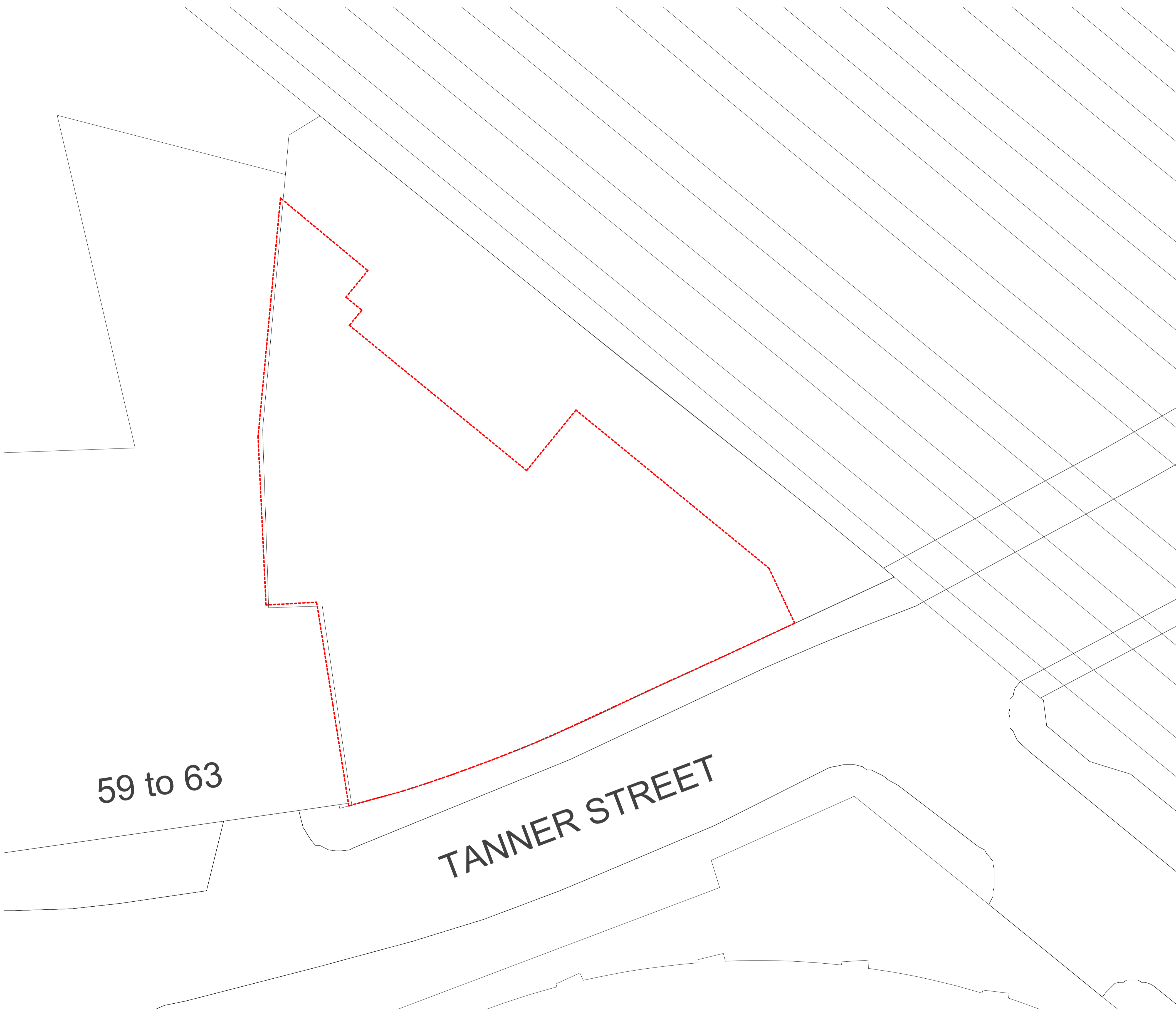
E-00-Site Plan - 1_100 1 : 100