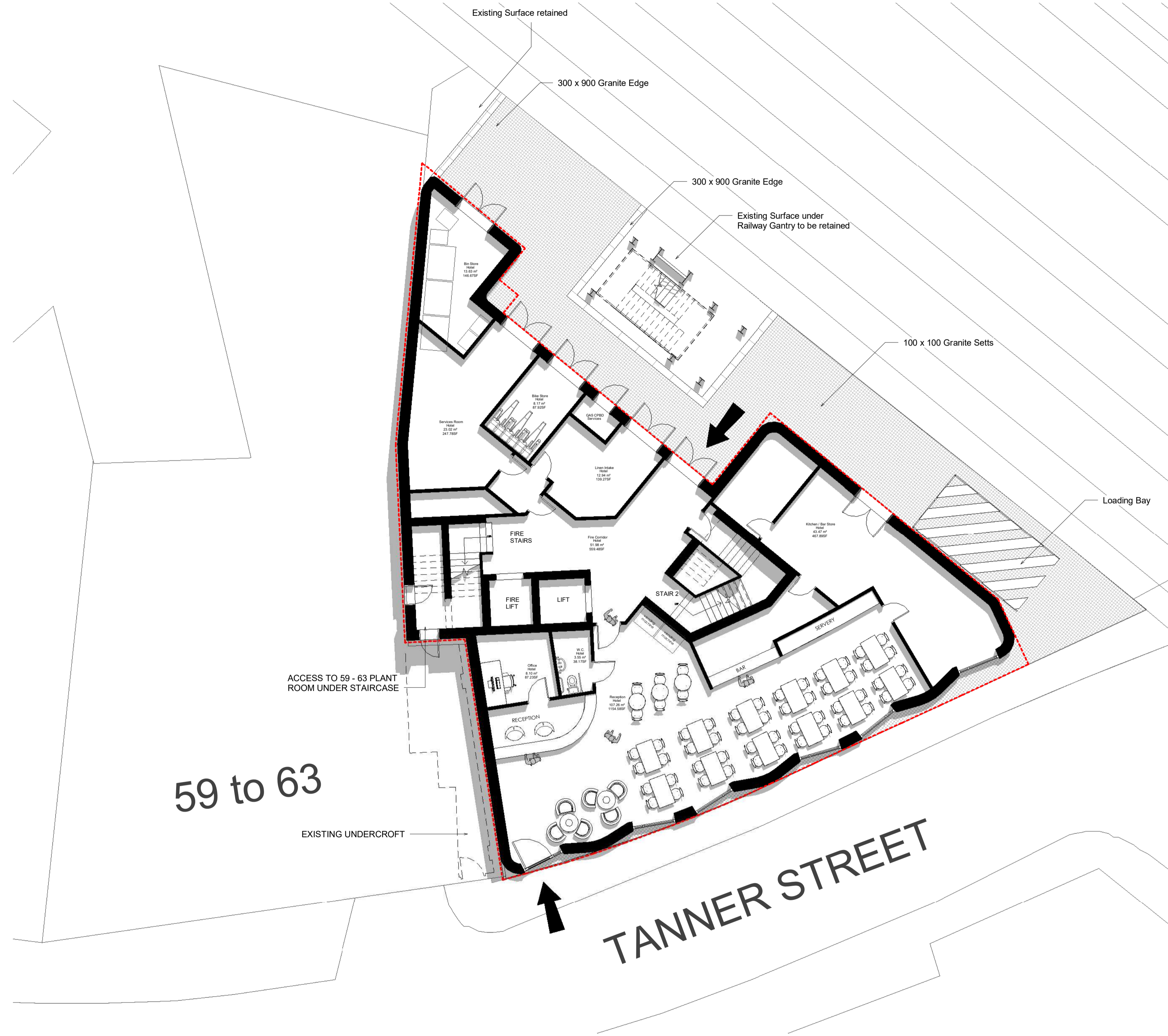
P-00-Site Plan - 1_100 1 : 100