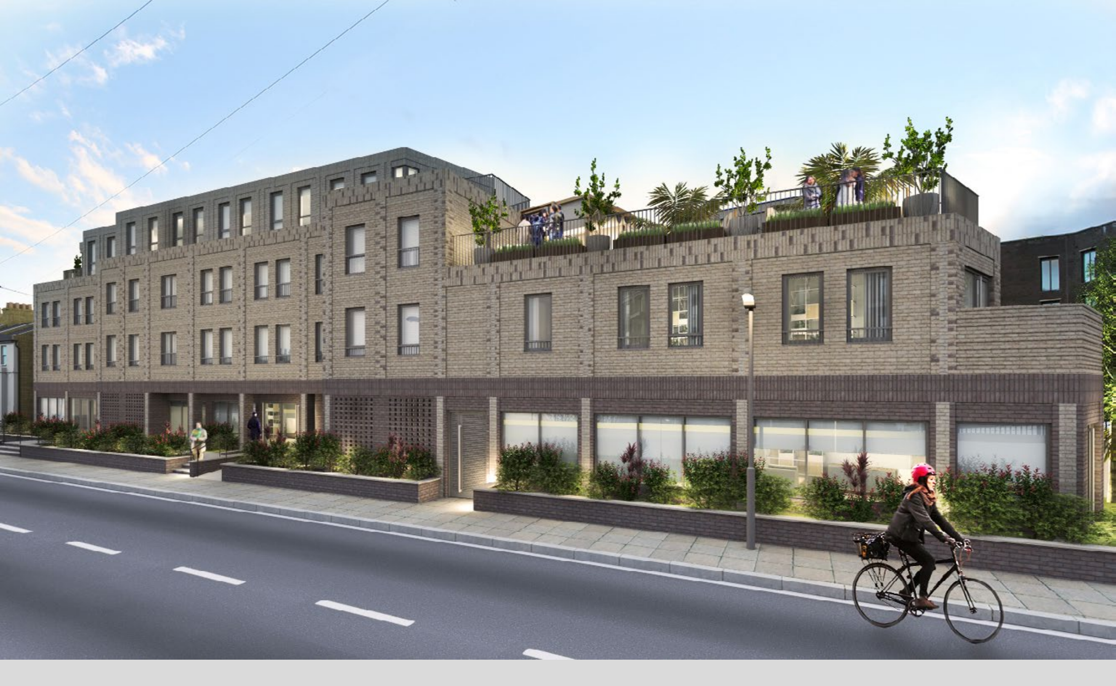
Unit 2, Crest Apartments, Doggett Road, Catford SE6 4PZ Ground floor B1 commercial unit available for sale or to rent