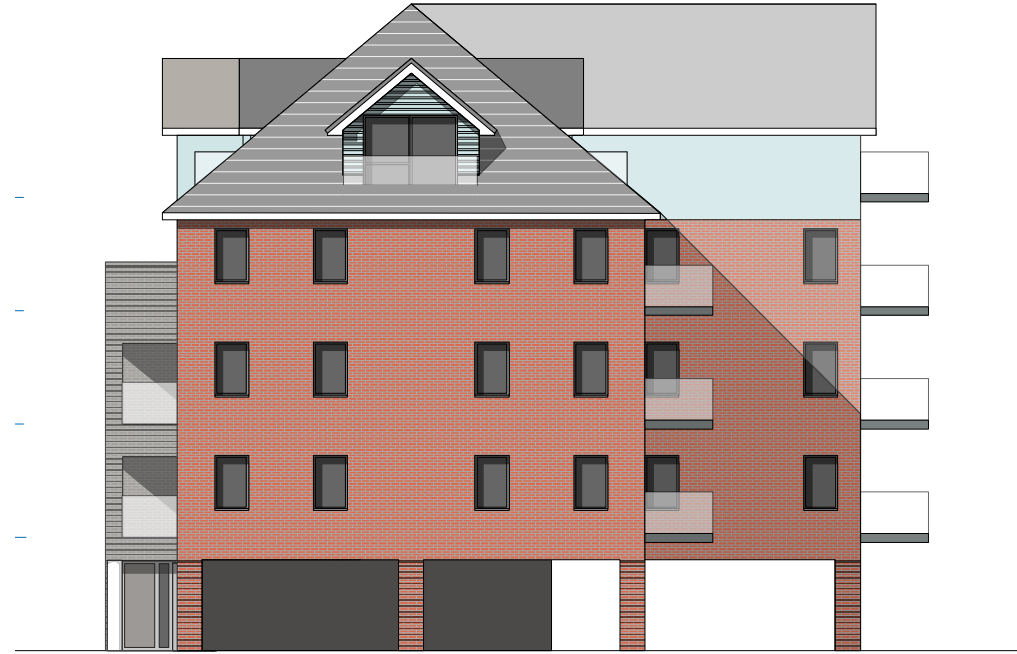
EAST FLANK ELEVATION