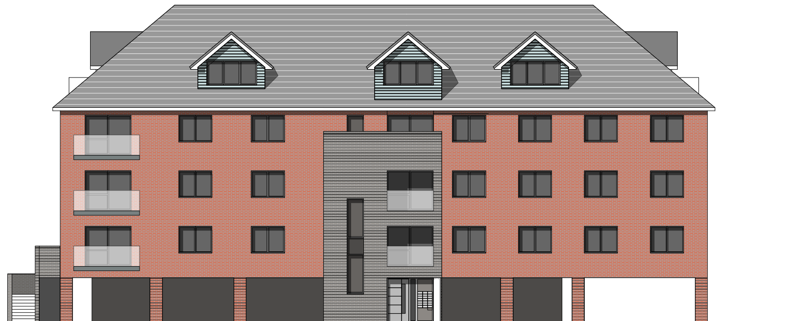
MILL HALL ELEVATION